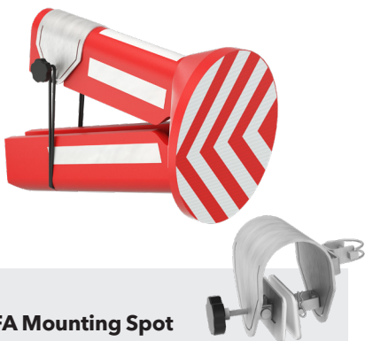
DAFA Tip Protector C30-MS

Different mounting options, so you can choose the one that fits your specific requirements.