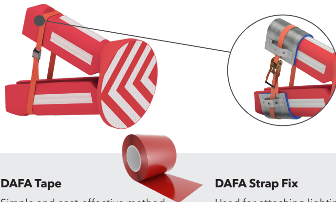
DAFA Tip Protector C30/L20