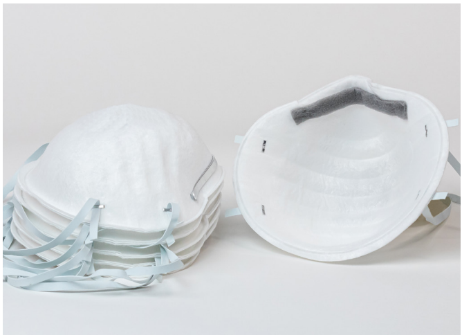
At DAFA, we develop, manufacture and supply nose pads for masks in close cooperation with our customers. Our years of experience within the industry, combined with our broad range of solutions for masks, make us a trusted and versatile partner