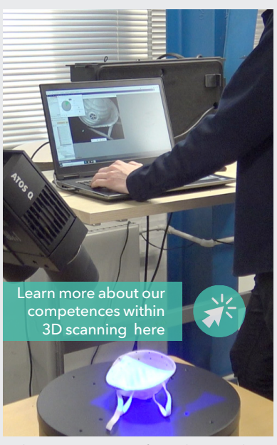
In-house 3D scanning - for analyzing and reconstructing products digitally.